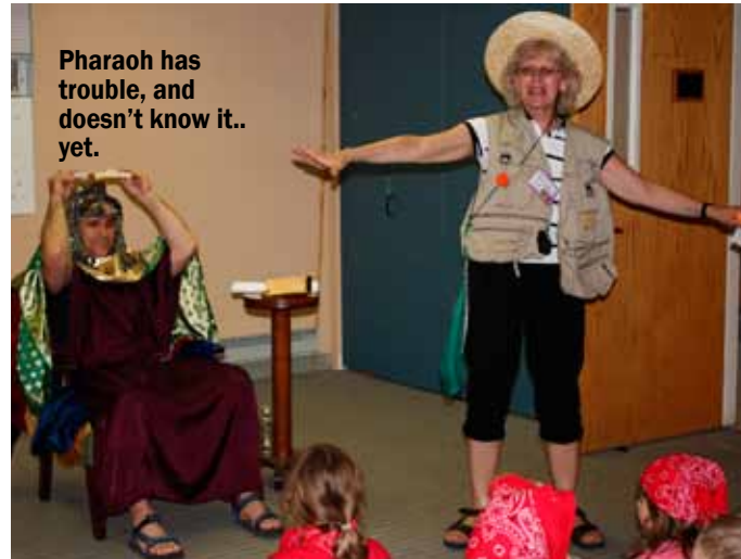
Pharaoh has trouble, and doesn't know it.. yet.