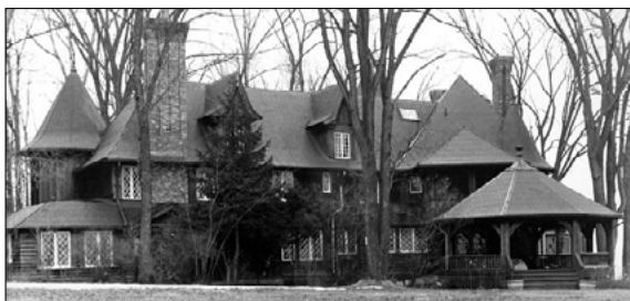
Galilee Lodge at Casowasco