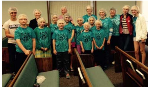
K.A.N. food packing crew

Bright and early on Saturday, September 26, a group of 18 K.A.N. kids, parents, and friends gathered with a group of 145 members of our community to scoop, weigh, seal, sort, and package meals for Feed My Starving Children. These meals, consisting of rice, soy, dehydrated vegetables, and a flavorful powder of vitamins and minerals, will be sent to starving and malnourished children in over 70 countries around the world. Our group of 18 worked at Table 3, rotating through the jobs of holding the bags under the funnel, scooping the ingredients into the funnel, weighing the bags to ensure the appropriate amount of ingredients, closing the bags with a sealing machine, sorting the bags, and packing them up in boxes.