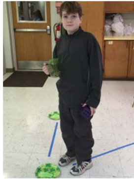
K.A.N. kids played a Haiti agricultural project game