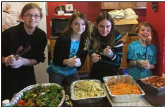
Serving love and a hot meal at the Rescue Mission.

We learned about shelter and care that is provided to people without homes, their food pantry, and other services provided at the Rescue Mission. Following their talk, we did some brainstorming about ways K.A.N. could help, and then played a game of finding the missing