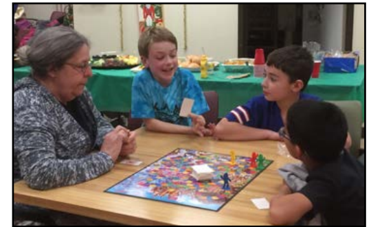
Games at Woodsedge.

us about how the Giving Tree program is set up at LUMC and All Saints and answered several thoughtful questions from the K.A.N. kids. These ornaments, made with love and surrounded with prayer, communicate God’s love both to those who select the ornaments from the tree to provide presents for children of different ages, but also to the families who thankfully receive these gifts of love at Christmas.